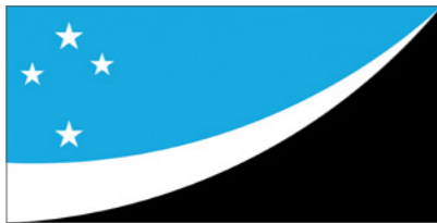
Land Of The Long White Cloud (Ocean Blue) Designed by: Mike Archer