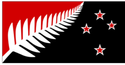
Silver Fern (Black, White and Red) Designed by: Kyle Lockwood