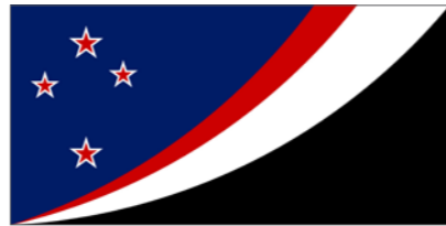
Land Of The Long White Cloud (Traditional Blue) Designed by: Mike Archer