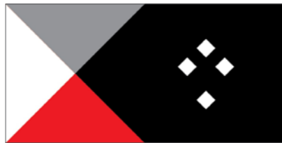
Tukutuku Designed by: Pax Zwanikken