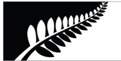
White & Black Fern Designed by: Alofi Kanter