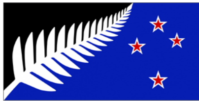
Silver Fern (Black, White and Blue) Designed by: Kyle Lockwood