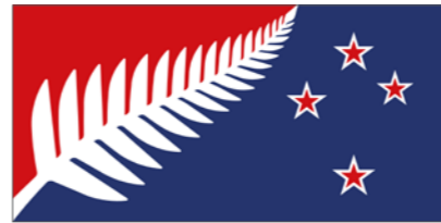
Silver Fern (Red, White and Blue) Designed by: Kyle Lockwood