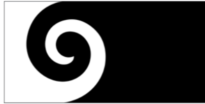
Koru (Black) Designed by: Andrew Fyfe