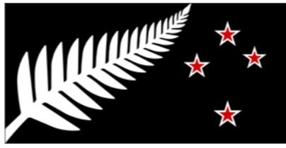
Silver Fern (Black with Red Stars) Designed by: Kyle Lockwood