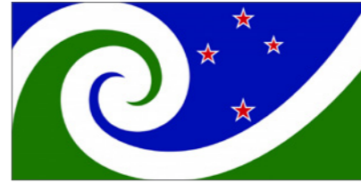
Manawa (Blue & Green) Designed by: Otis Frizzell