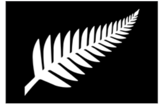
Silver Fern (Black & White) Designed by: Kyle Lockwood