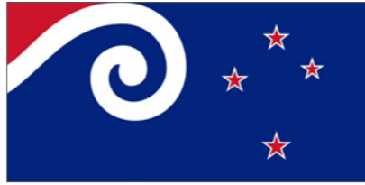
Koru and Stars Designed by: Alan Tran