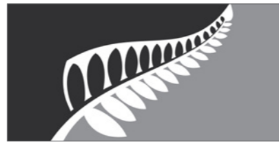
Silver Fern (Black & Silver) Designed by: Sven Baker