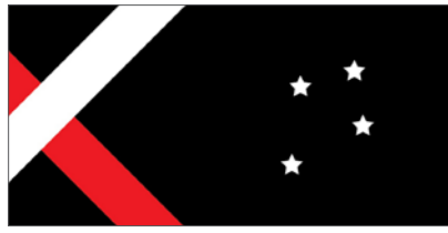
Raranga Designed by: Pax Zwanikken